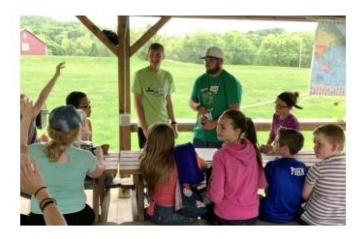
This station emphasized the importance of the dairy industry, complete with a young calf. At other stations, students had the opportunity to interact with animals including chickens and rabbits.