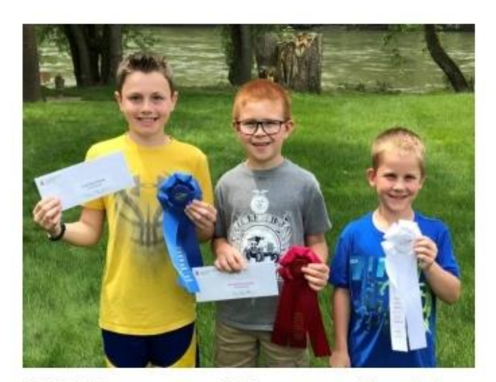
2019 Newport Essays – 79 entries

The awards ceremony for this annual contest was part of the Ag Day field day held on May 23, 2019 at the Millerstown Community Park.