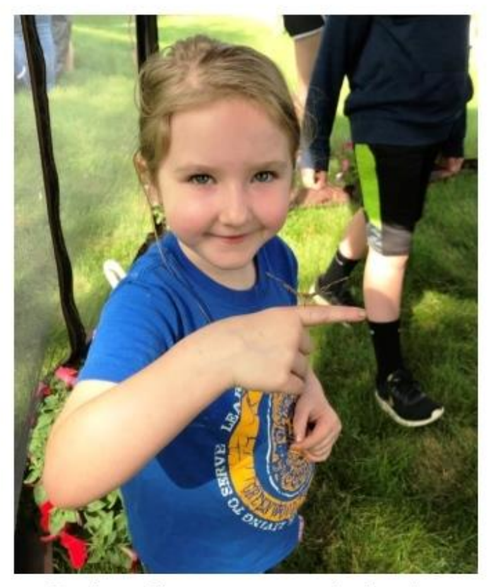
The butterfly tent was a popular learning station. Preparing for this required purchase of and caring for butterfly cocoons until the butterflies emerged.